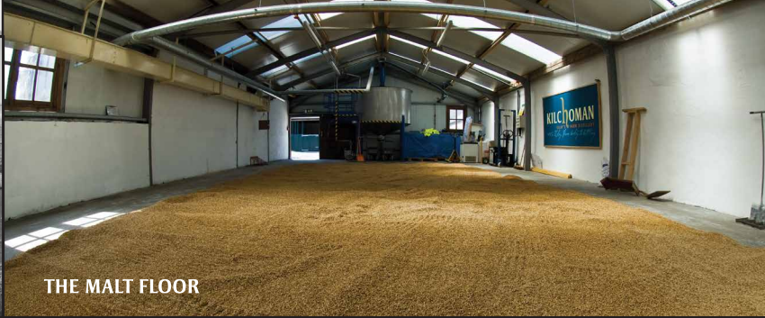
THE MALT FLOOR