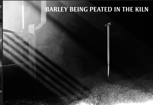
BARLEY BEING PEATED IN THE KILN