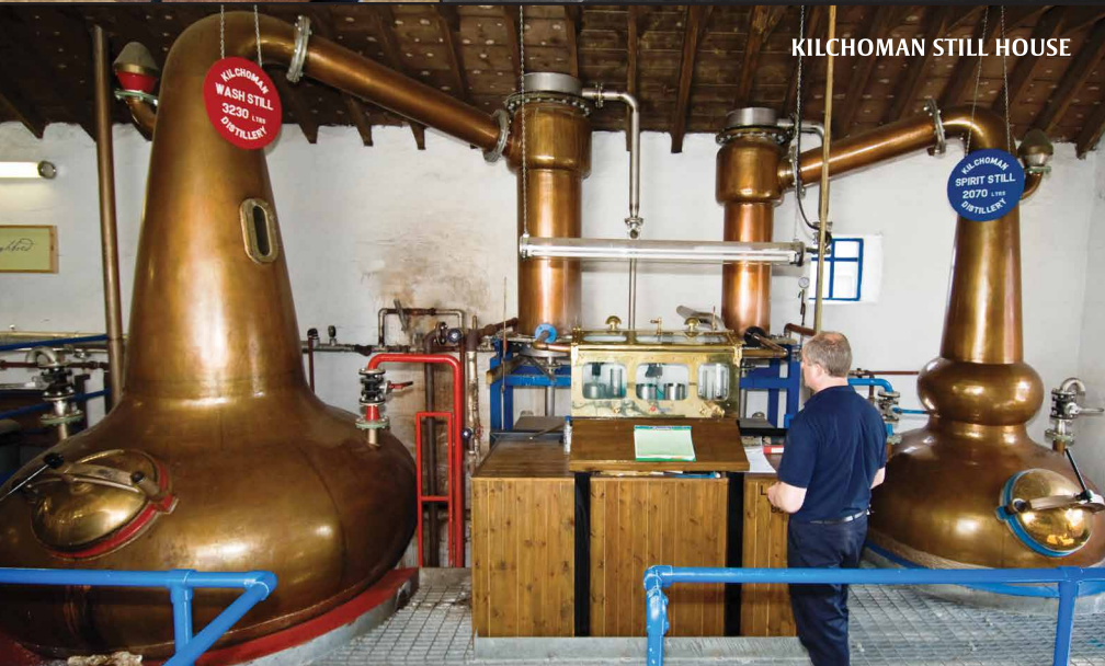
KILCHOMAN STILL HOUSE