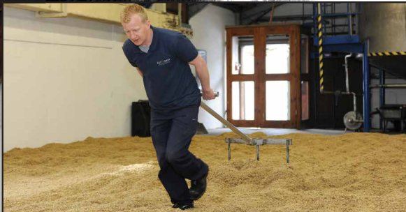
GERMINATING BARLEY ON THE MALT FLOOR